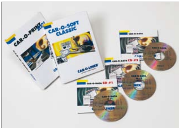
The vehicle database always gives access to current and reliable reference data for the measuring system.

Car-O-Data – the most complete vehicle database on the market. Covering nearly all new and updated models – today more than 10,000 vehicles – it consistently provides current and reliable data. Being integrated with the software, Car-O-Data is truly used to its fullest potential.