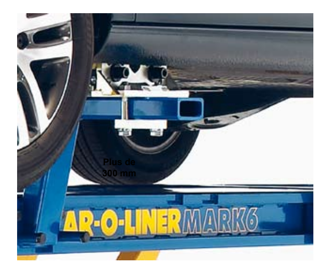
Longer bench arms allow maximum work space between bench and underside of vehicle.