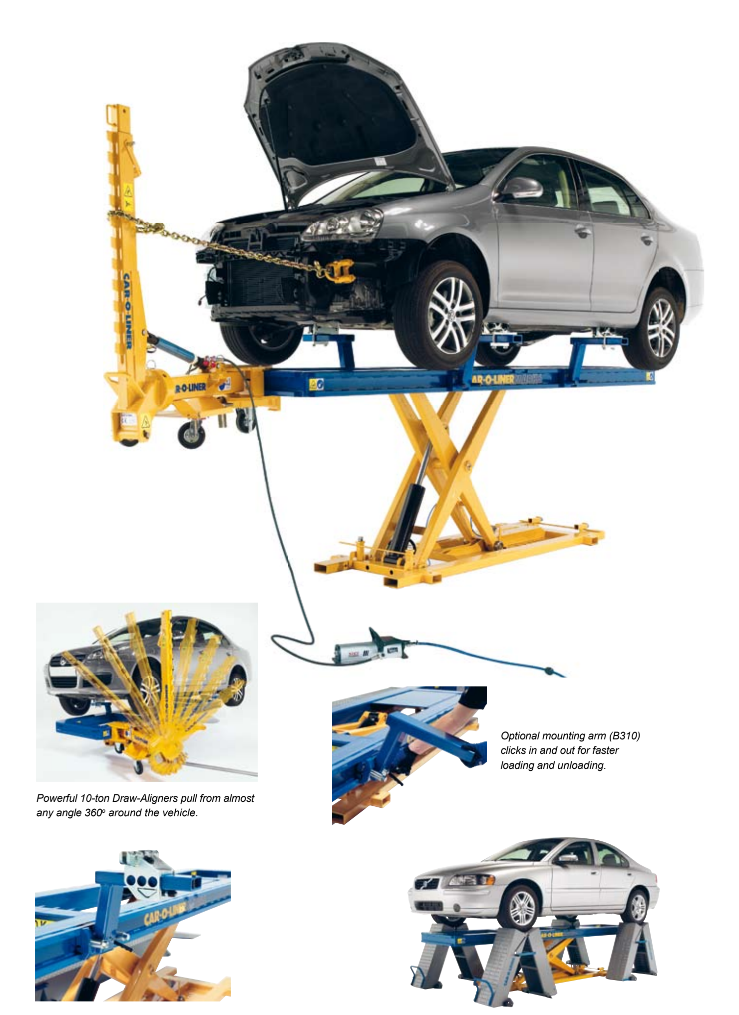
Optional chassis clamp (B110) offers faster setup and removal using just two bolts.