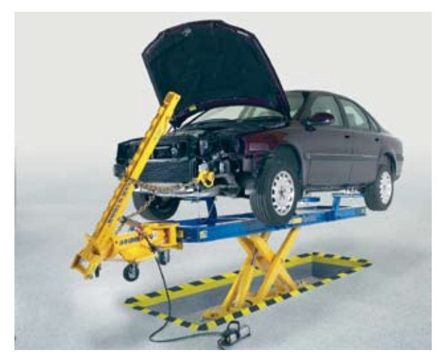
Inground installation leaves frame level with floor allowing for easy drive-over and clean shop appearance.